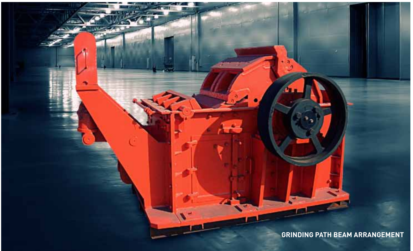
GRINDING PATH BEAM ARRANGEMENT