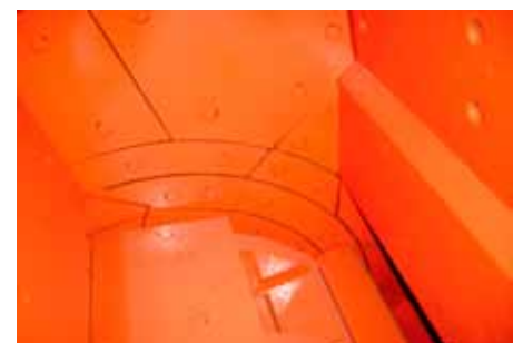
CAST HIGH CHROME SIDE LINERS