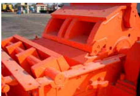
HEAVY DUTY ROTOR WITH FOUR S TYPE HIGH CHROME BLOW BARS